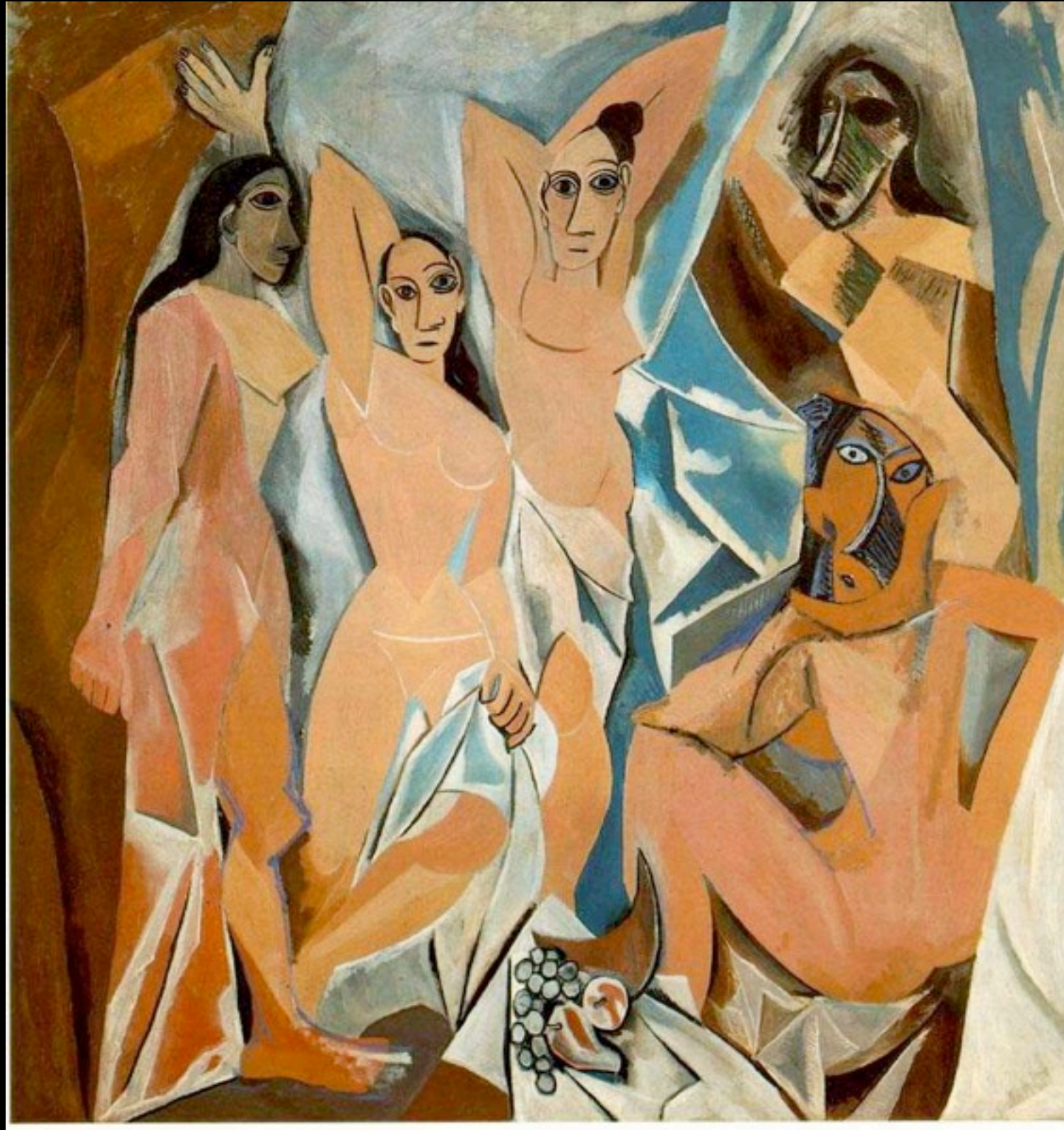
Pablo Picasso, Les Femmes d'Alger (O Version O) , 1907